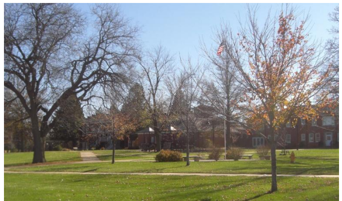
The Family Resources campus

For more on BRC – and Rotary – see: http://www.bettendorfrotary.com/