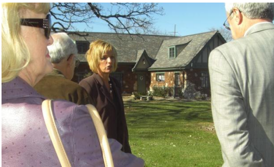
After lunch, BRC members toured the Family Resources campus to see the facilities.

To learn more, visit www.famres.org , and to help call the Development Office, 468-2242.