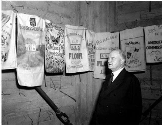
Herbert Hoover photographed in 1941 with some flour sacks sent by grateful Belgians.

Organization of the Executive Branch of the Government.