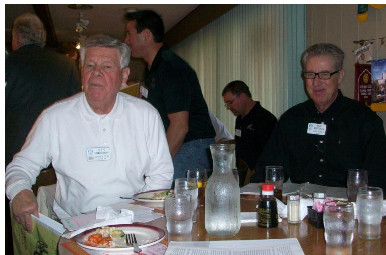
Bouncing to 'B' words in 'My Bonnie Lies Over the Ocean' – sing-along fun