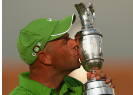
After winning the British Open Championship, Stewart Cink kissed the Claret Jug.

Watson came within a hair's breadth of claiming his place among the game's immortals when he failed to hole a 10-foot par putt on the 72nd green of the 138th Open at Turnberry. That putt would have ensured a sixth title in the world's oldest championship, the same number won by Harry Vardon in 1914 and, at the age of 59, would have demolished the previous record, which