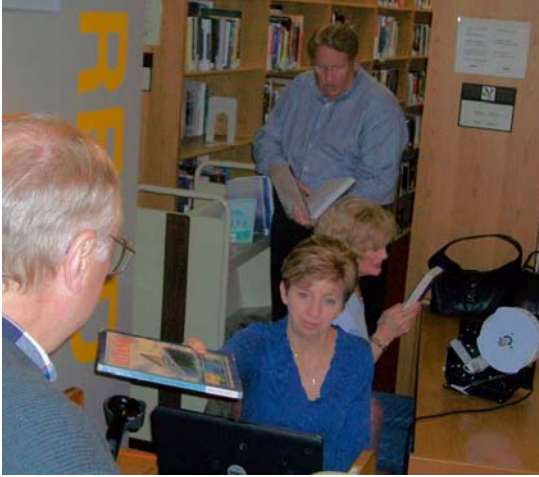
"Team Bookworm" members live up to the team cheer: "Rack 'em, tag 'em, scan 'em, stack 'em!"

→ Library book-tagging. Still one Monday evening left – 5-9 p.m. Nov. 30 – for Bettendorf