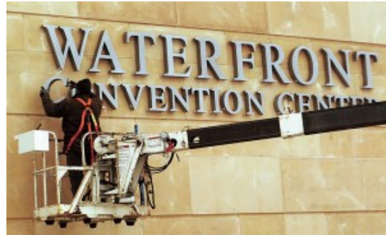
Workers put finishing touches on the Quad-Cities Waterfront Convention Center in early February.

On our tour of the 50,000-square-foot facility, we’ll see such features as the