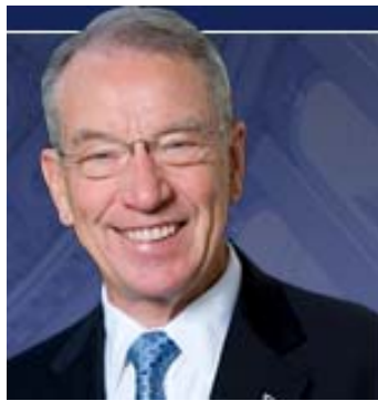
U.S. Senator Charles Grassley

Our guest speaker this week was Charles Grassley, U.S. Senator from Iowa. Senator Grassley opted to make his time at our speaker stand more of a town meeting format. Our members asked questions ranging from the upcoming election, the economy, and issues important to Iowa. As the ranking member of the Finance Committee, Senator Grassley was more than capable in addressing concerns about our economy. Many of our members voiced some excellent concerns and questions.